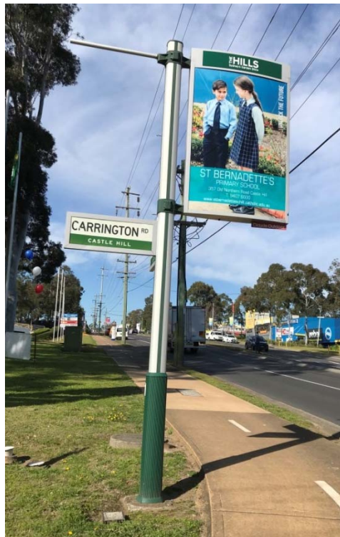
Figure 2 Example Advertising on Street Signs

There are also potential opportunities for advertising to be placed on bridges (such as pedestrian bridges) over major road corridors. A pedestrian bridge has recently been constructed by Council over Windsor Road, Kellyville and there are a number of planned pedestrian bridges within the Balmoral Road Release Area and commercial centres such as Castle Hill and Baulkham Hills. While Council does not currently have any advertising structures on bridges within the Shire, there may be opportunities to do so in the future as part of existing and/or future bridge infrastructure. The example below shows this form of signage which was completed on behalf of NSW Roads and Maritime Services.