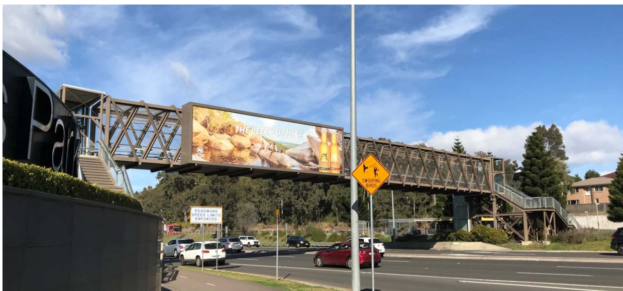
Figure 3 Example Advertising on Bridges

There are also potential opportunities for advertising to be placed on bridges (such as pedestrian bridges) over major road corridors. A pedestrian bridge has recently been constructed by Council over Windsor Road, Kellyville and there are a number of planned pedestrian bridges within the Balmoral Road Release Area and commercial centres such as Castle Hill and Baulkham Hills. While Council does not currently have any advertising structures on bridges within the Shire, there may be opportunities to do so in the future as part of existing and/or future bridge infrastructure. The example below shows this form of signage which was completed on behalf of NSW Roads and Maritime Services.